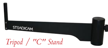
Tripod / "C" Stand Docking Bracket