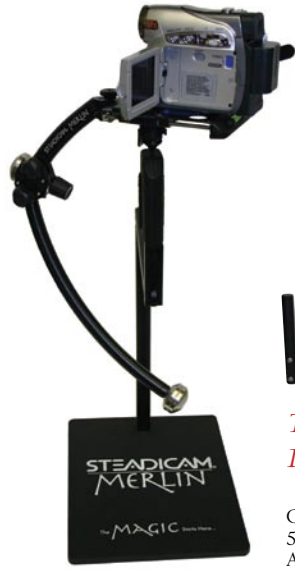
Table Top Stand